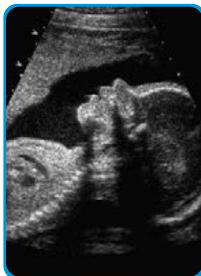
Fetal ultrasound - 20 weeks gestation